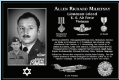
8"x 16"- $850