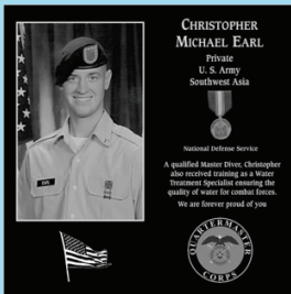
8"x 8"- $400